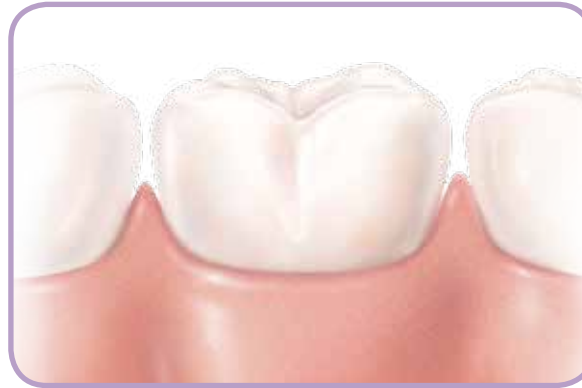
Healthy teeth and gums

The check-up should also include your tongue, throat, face, head and neck. This is to look for any signs of trouble, swelling or cancer.