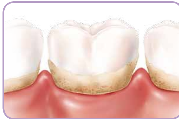
Plaque and tartar build-up