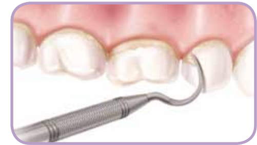
Scaling removes plaque and tartar

Brushing and flossing help clean the plaque from your teeth. But you can't remove tartar at home. During the cleaning, your dental professional will use special tools to remove tartar. This is called scaling .